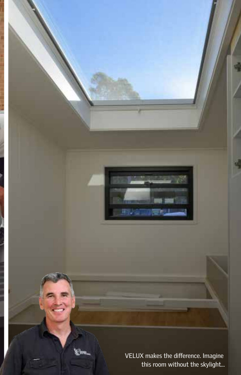
VELUX makes the difference. Imagine this room without the skylight...