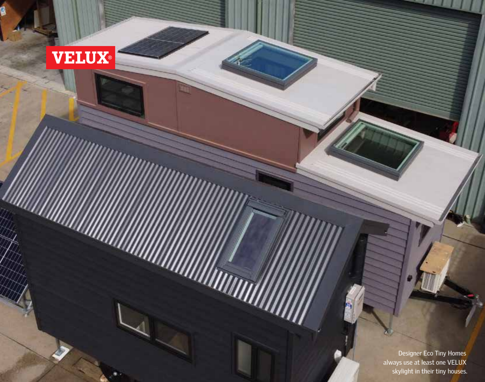
Designer Eco Tiny Homes always use at least one VELUX skylight in their tiny houses.