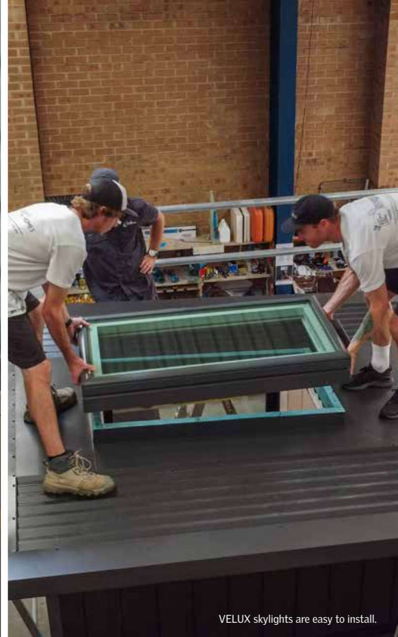
VELUX skylights are easy to install.